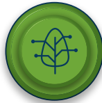
Agribusiness & Agriculture Technology