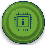
Information Technology & IoT